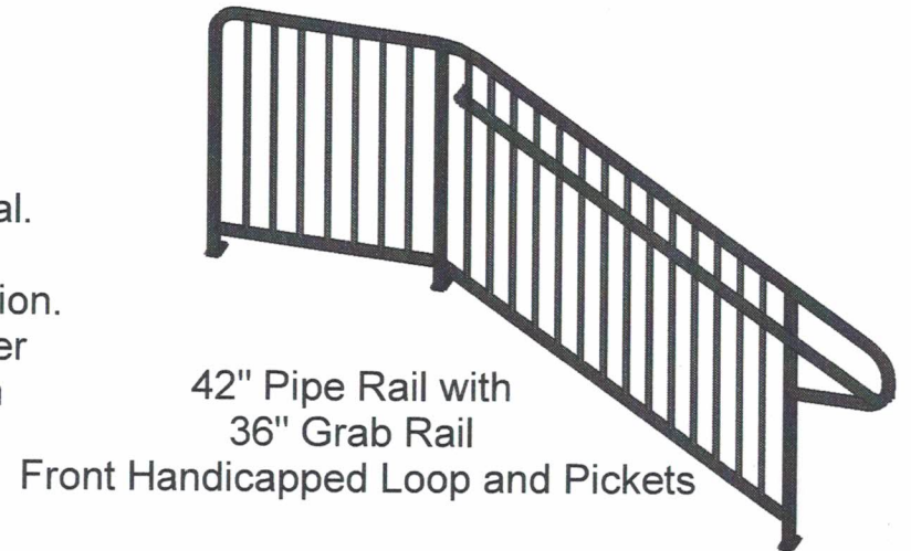
42" Pipe Rail with 36" Grab Rail Front Handicapped Loop and Pickets

Notes: 1 1/4" Schedule 40 Pipe Typical. 7/16" Square Bar Pickets. See Rail Foot Detail for Description. All rails come with factory primer and should be top coated with 100% Alkyd Enamel Paint.