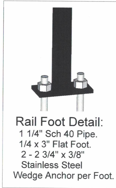
Rail Foot Detail: